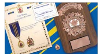
Honours and Awards

For more information Call the Branch Office at 519-745-5101