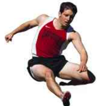
Track & Field

Have a nice summer and thanks to all the people that are helping me, it makes my job easier.